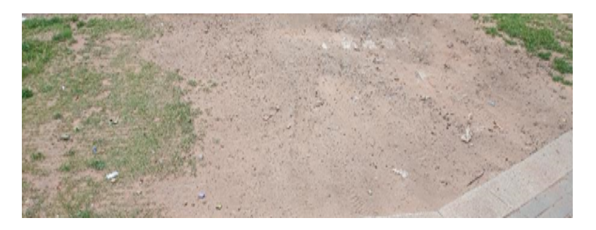
Example illegal driveway crossing

5.7 For illegal vehicle crossings, where possible, the Council will actively engage with residents to formalise the construction through Highways Development Control and an appropriate contractor.