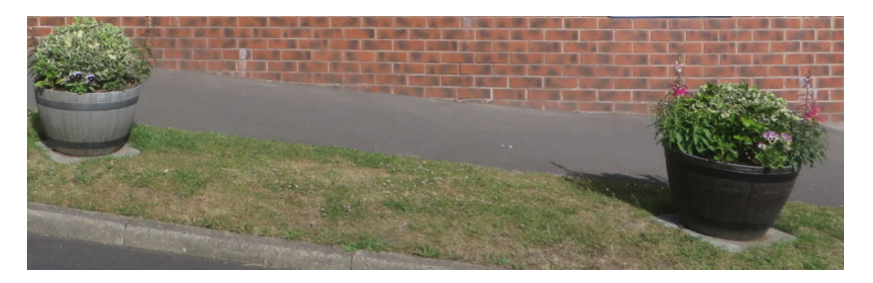
Example Barrel Planters placed by residents to prevent verge parking

4.12 Barrel Planters, filled with decorative bedding plants or other floral decations will be actively encouraged to protect verges from parking (whether funded by residents, Elected Members or Local Area Committees) subject to licensing and approval under Section 142 of Highways Act 1980 to ensure they are deployed on appropriate sites.