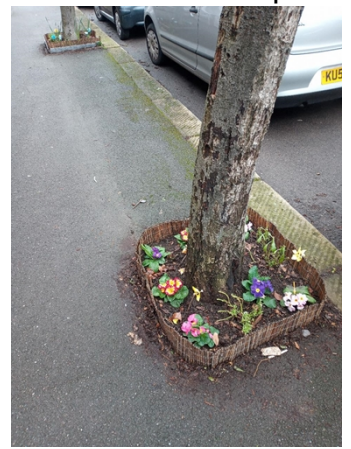
Example "Fairy Garden"

close to trees and potentially damaging their root systems will be tolerated.