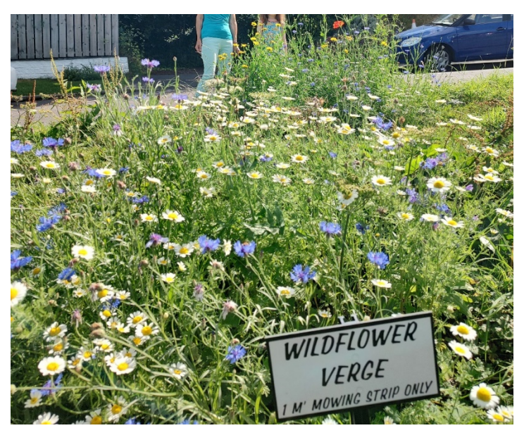
Example site that has been subject to resident involvement during 2022 trials.