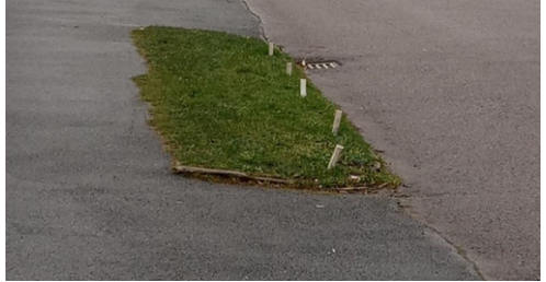
Examples of resident installed verge protection measures to prevent parking